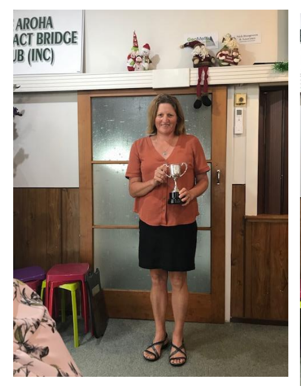
Best Novice of the year