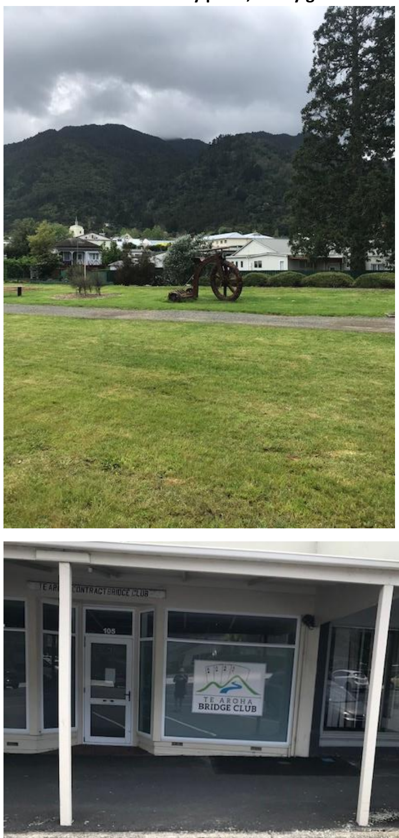
BRIDGE TE AROHA: lovely place, lovely game A V + +

Welcome to what I hope will be the first of monthly newsletters about bridge in Te Aroha, about those who play bridge at the club, about what has