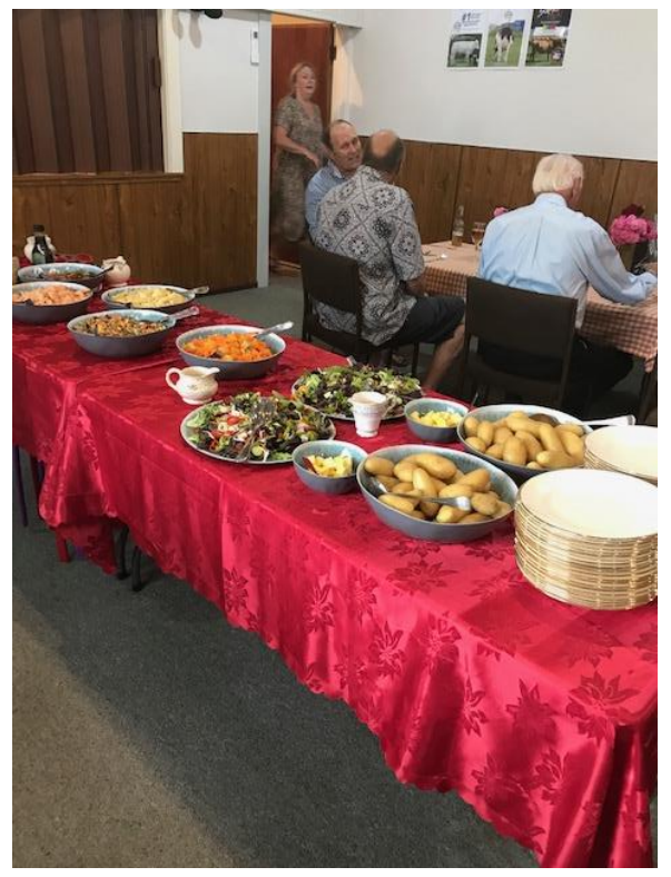
and there was barely a carrot in sight<sup>1</sup>

<sup>1</sup> the relevance of this comment will become apparent to all in the years to come. For now, just accept that this vegetable's near absence made at least one player very happy.